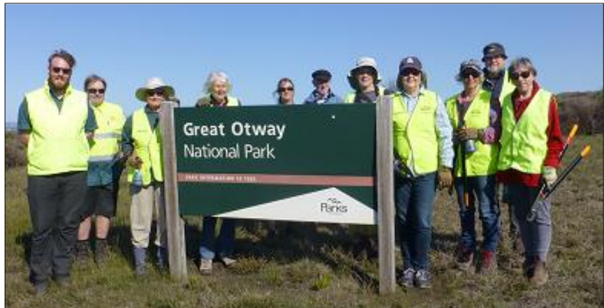
Above: The Friends were joined by Parks Vic rangers at the September weeding day.

This was a great contrast to the result of the previous control burn in 2004 when carpets of this weed covered the ground. Obviously we must have done a thorough job when we weeded in 2005.