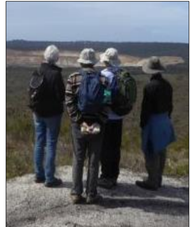
Top: A well-deserved lunch break on Boundary Track. Above left: Out came the sun and the group enjoyed watching the sun orchids respond. Above right: Looking across the heathland at the mine site. Bottom: Following Boundary Track into the valley.

The views of the mine have changed with the coal face now covered and water accumulating at the base. Somehow the scar seems larger. Rain was threatening but we managed to have lunch at the corner of Peregrine Track before it became heavy and had us stepping out along the much eroded track back to Bald Hill Rd. We all agreed it had been a very enjoyable walk. Alison Watson